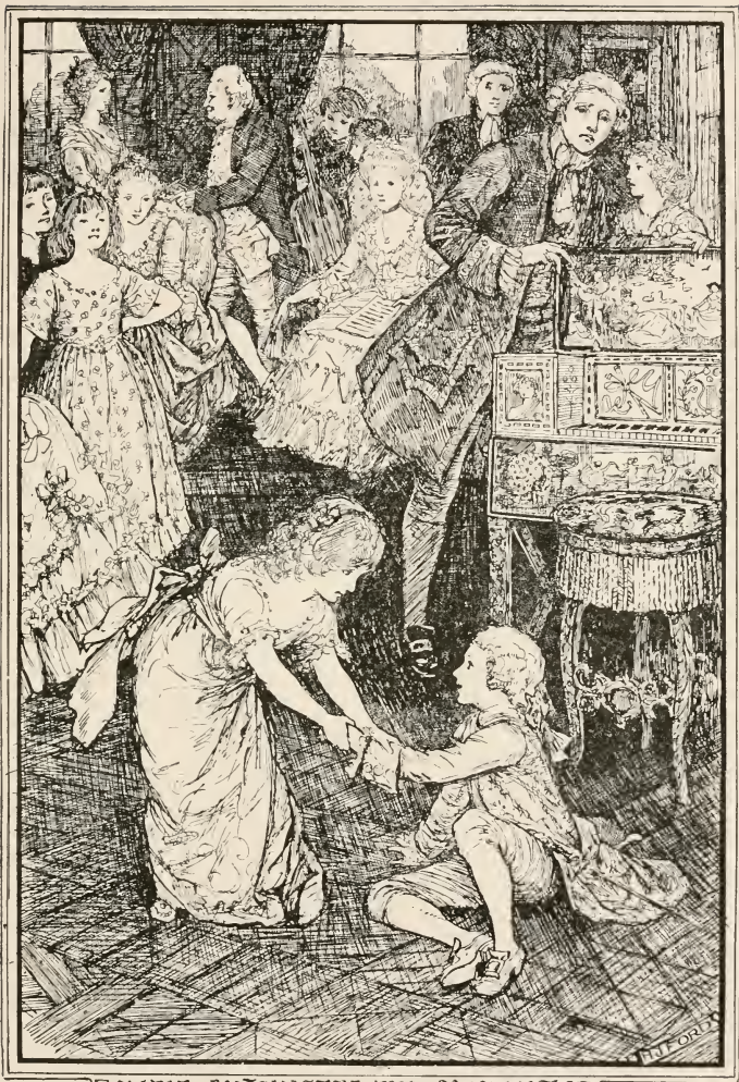
MARIE ANTOINETTE AND MOZART.